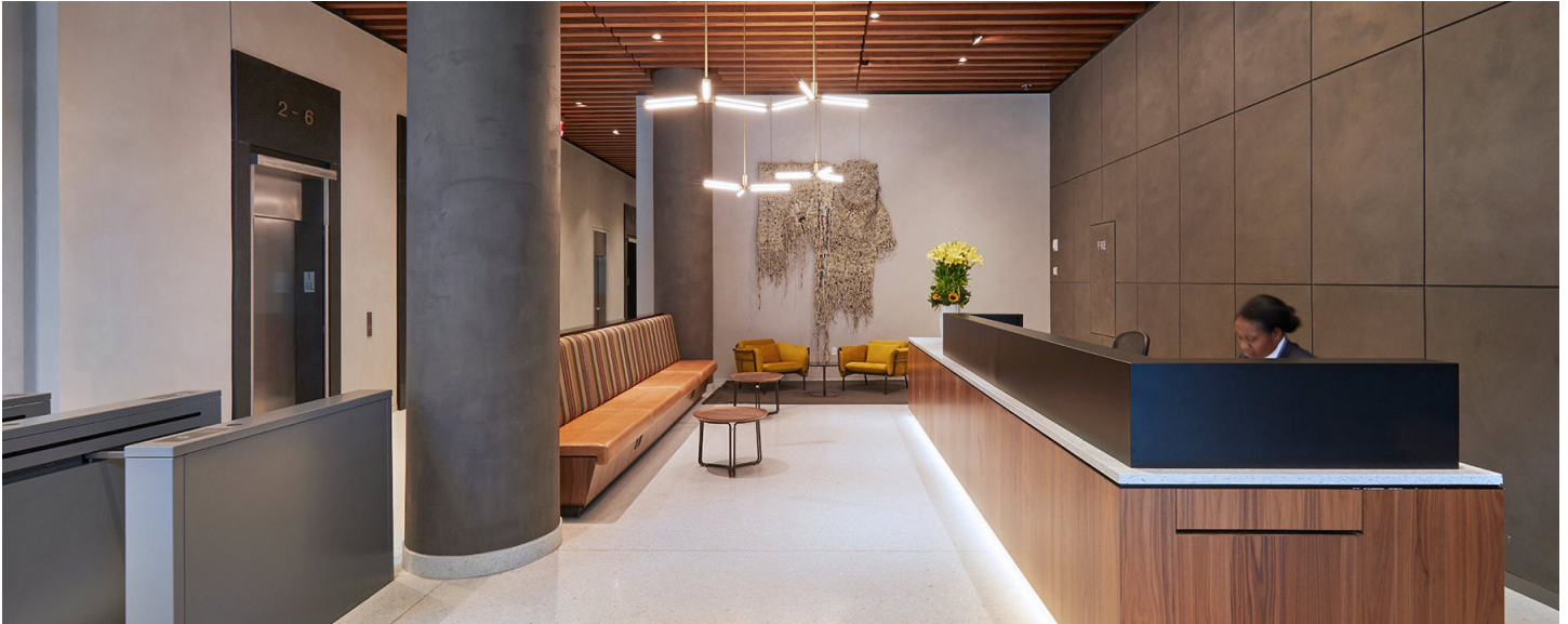
160 Varick Street lobby