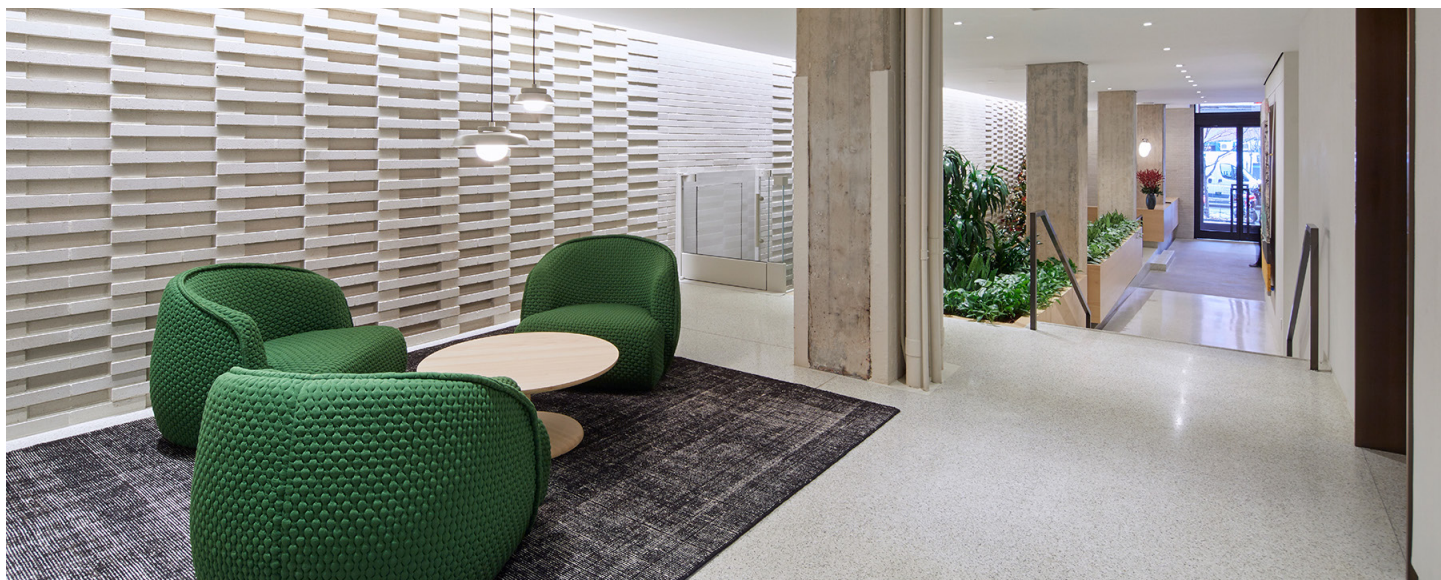
155 Avenue of the Americas lobby